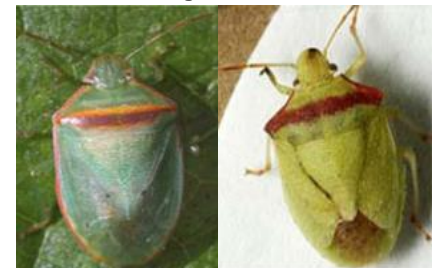
Red Banded Red Shouldered