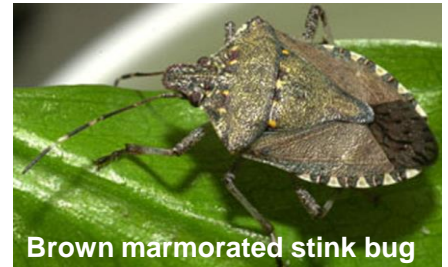
Brown marmorated stink bug

Use FL Indoor\Outdoor for insects that enter the home, spray around windows and doors.