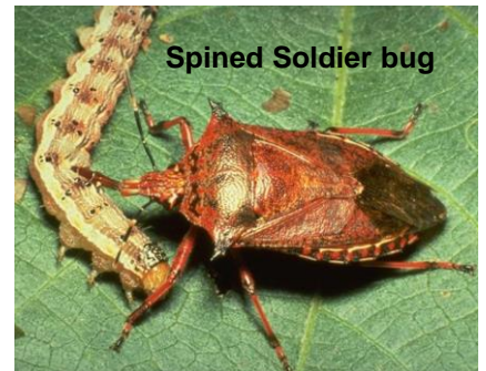
Spined Soldier bug